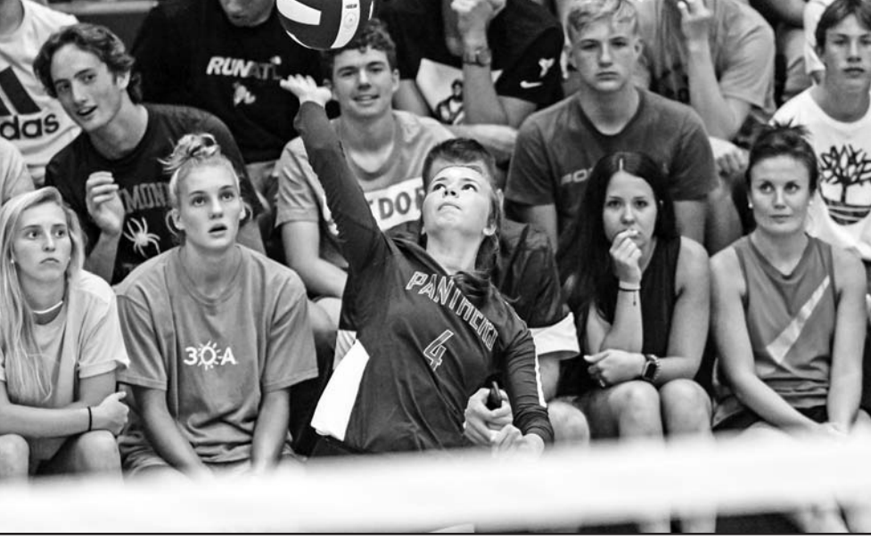
to put some things together against Gilmer but wound up

blowing a nine-point lead. One of the things I'm hoping our teams away. Especially when to town for a 5 p.m. start. we're up by nine points.'