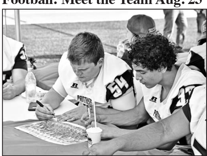
Union County football's annual Meet the Team event is scheduled for 7 p.m. on Friday Aug. 23 at Mike Colwell Memorial Stadium.