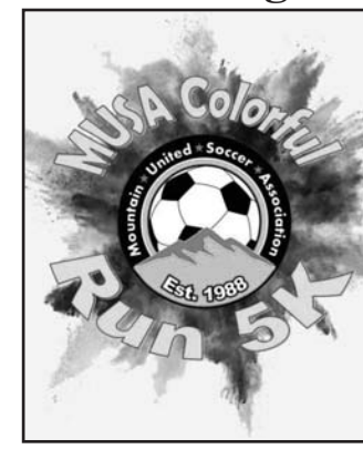
will get you on there!

All monies will go to help kids with their individual registration costs.